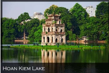
HOAN KIEM LAKE

Welcome to Vietnam!! Upon arrival, meet your English-speaking escort who will assist in obtaining your Visa-on-Arrival, whisk you thru the priority lines and transfer you to the hotel.