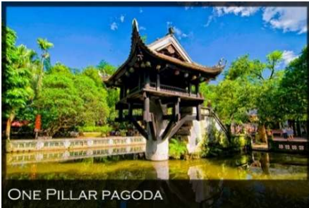
ONE PILLAR PAGODA

Begin the day exploring the capital, including the Ho Chi Minh Mausoleum , where the remains of the national hero, the father of the nation rest, and his former residence. Visit the Ho Chi Minh's Stilt House and the one-Pillar Pagoda , a historic Buddhist temple, built of wood on a single stone pillar. Then, visit the Tran Quoc Pagoda , regarded as the most ancient pagoda of the city built in the 6 th century and a cultural symbol of Vietnamese.